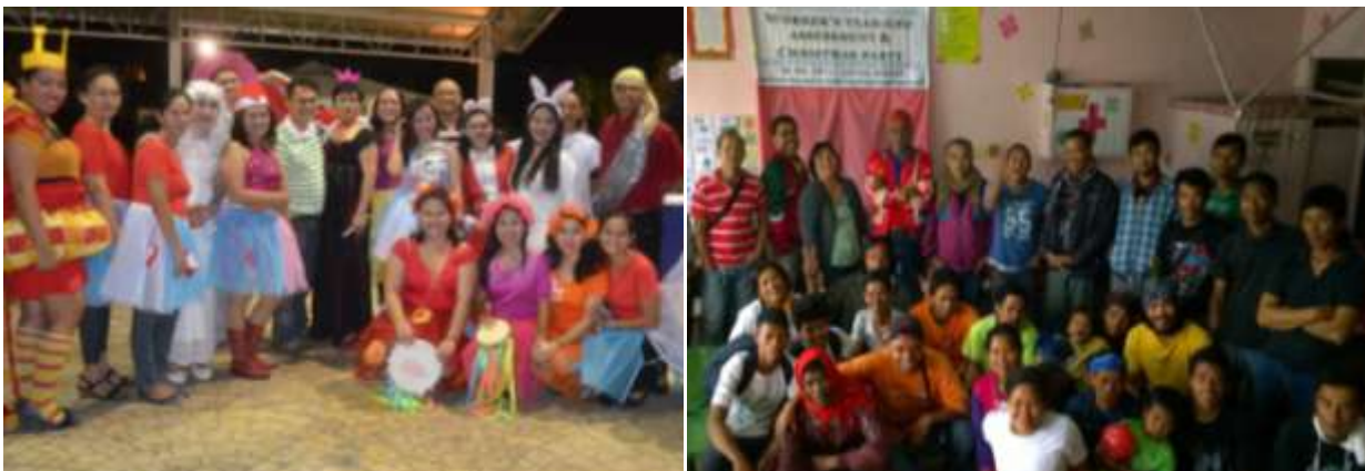
University constituents celebrated Christmas. At left are the winners of best costume in the University fellowship; at right are the agro-forestry workers in Marilog Land Reservation.