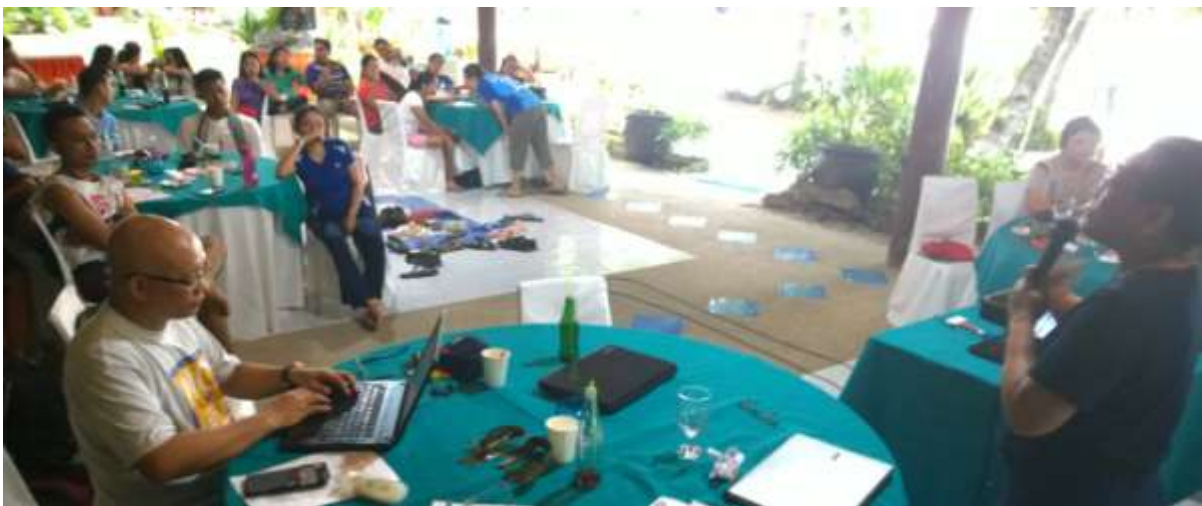
Various units held their year-end assessments in December of 2015. Shown above is the assessment workshop by the Office of the Chancellor.