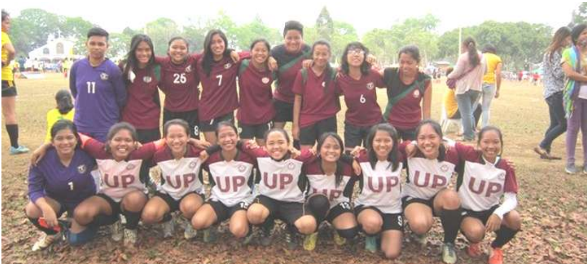
The UP Mindanao Ladies Football Varsity competed in the 12 th Del Monte Cup on 8-9 April at Camp Phillips Football Grounds, Bukidnon. The team finished 2 nd Runner-up in the Women's category.