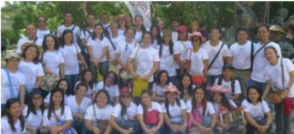
Delegation to Davao City Women’s Day Parade, 08 March