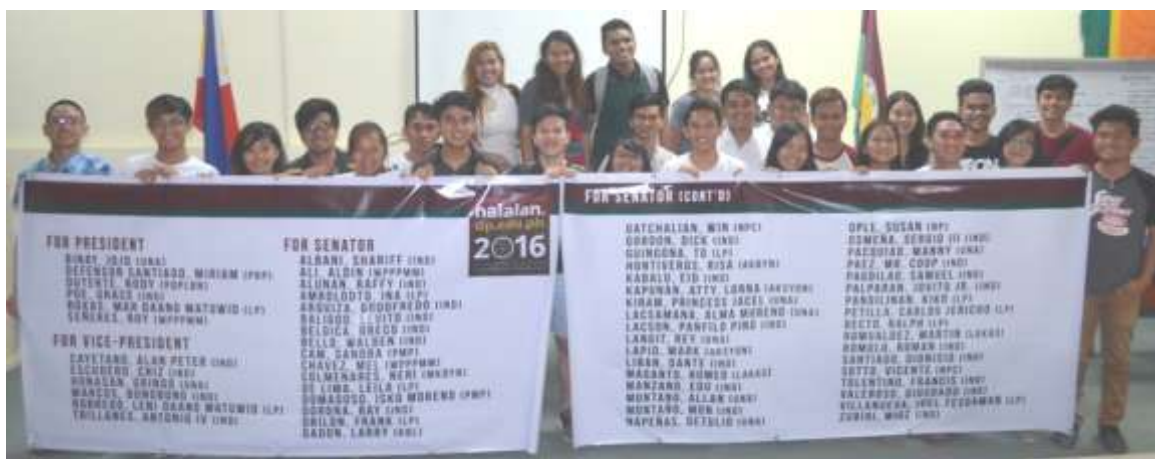
Students present a Wall Poster enumerating the candidates for selected positions before its installation in the campus.