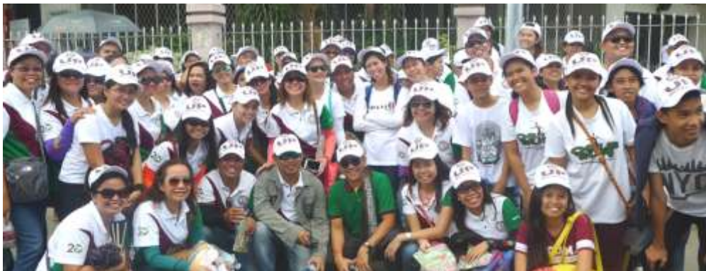
Delegation to Araw ng Dabaw Parade, 16 March