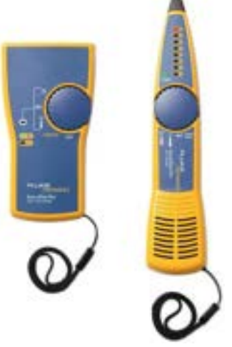
Figure 1. Network Cable Tester (Toner and Probe)