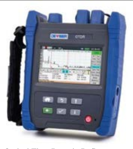
Figure 2. Optical Time Domain Reflectometer (OTDR)