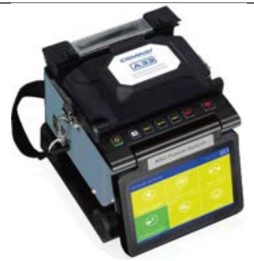
Figure 1. Fusion Splicer