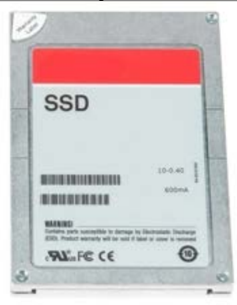
Figure 4. Solid State Drive