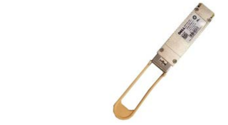
Figure 3b. Networking Transceiver for Dell T640