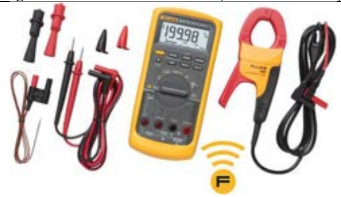
Figure 2. True-RMS Digital Multimeter Combo Kit