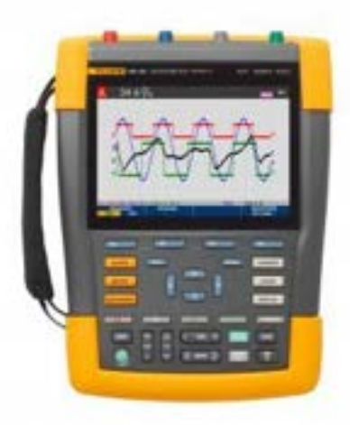
Figure 3. Portable Oscilloscope/Scopemeter