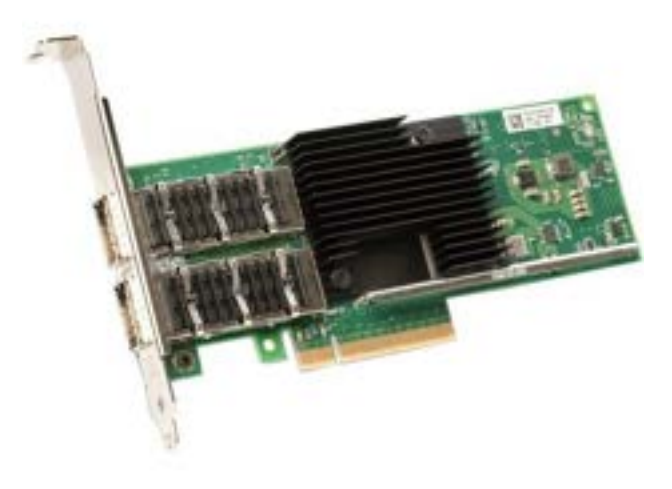
Figure 3a. Network Interface Card (NIC) for Dell T640